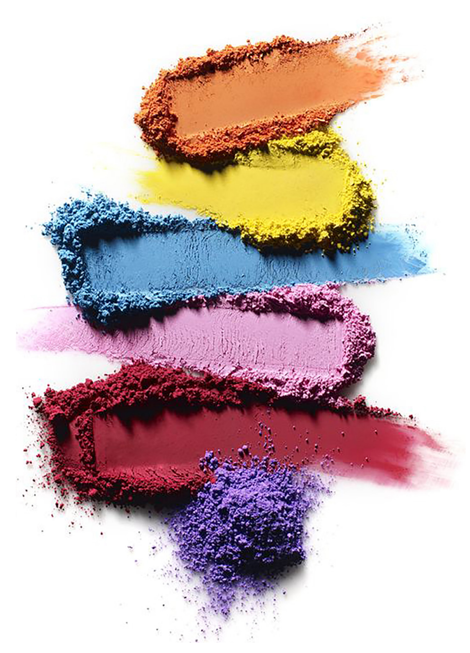
Illusional look of powder liposomes created with Aktin Technology